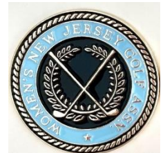
2022 New Member Gift – Ball Marker

Photos of all 2022 new members to date were displayed on the screen and those present were invited to stand in front of the podium to be acknowledged and to receive their WNJGA ball marker. The ball marker gift replaced bag tags that were originally the gift given to new members.